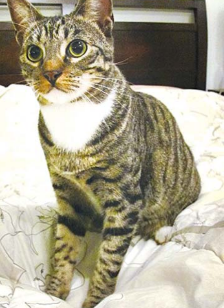
Q loves to be petted and brushed.