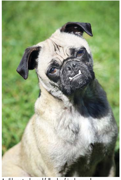
April loves to play and follow her friends around.

April is a sweet year old Pug with the cutest underbite. She is very playful and has a very sweet, loving personality. She is fine with all other dogs and is settling into her foster home well. April crates great at night, not a peep. She loves to chew on her nyla bone and will chase small stuffed toys when you throw them. As most Pugs do, she loves to be with you and will follow you from room