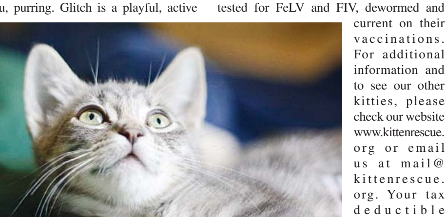
Glitch would love to come home and meet a new playmate.

Glitch's siblings have all been adopted and now it's her turn! She is an adorable, affectionate little tabby girl. Let her find her favorite place cuddled up close as possible to you, purring. Glitch is a playful, active