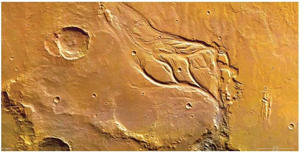
View from space showing Osuga Valles, an outflow channel thought to be eroded by catastrophic flooding on Mars.

The deadline for submitting entries to the Astronomers Without Borders (AWB) annual astropoetry contest has been extended to May 31. AWB is an international organization dedicated to increasing awareness of the universe among all peoples. See their website at: www.astronomerswithoutborders.org