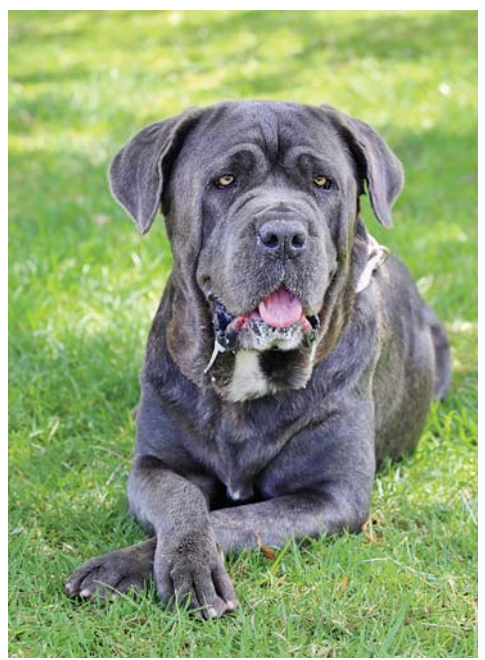
Bisha is so well mannered and needs a low-stress household.

Adopt a "Pet Without a Partner" and Give a Homeless Pet a Second Chance in Life